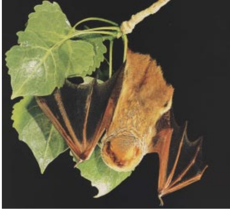
Western Red Bat.