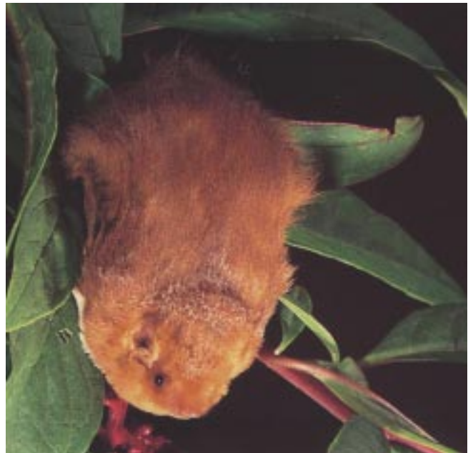
Eastern Red Bat. Harvey, M.J., J.S. Altenbach, and T.L. Best

As mentioned above, before 1988 all red bats in North America were considered to constitute a single species, Lasiurus borealis , with 2 recognized sub-species. The eastern sub-species, L. b. borealis , was found in the eastern and middle parts of the continent up to the Rocky Mountains, while the western sub-species,